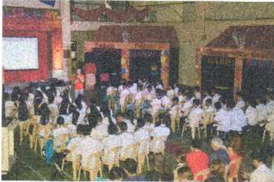
LIGHTS AND SOUNDS SHOW OF THE GARMENTS INDUSTRY