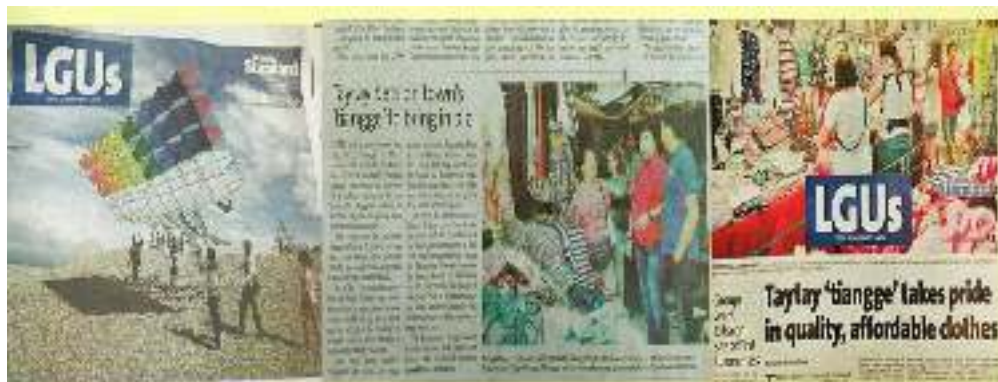
Manila Standard , a nationally circulated newspaper published daily in the Philippines since February 1987, featured the Municipality of Taytay and its booming Garments Industry on their LGUs Section