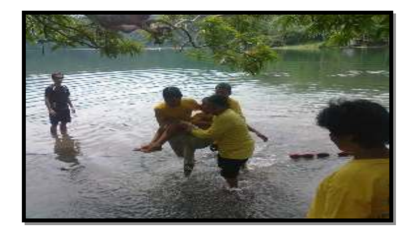
First Aid & Disaster Preparedness Training