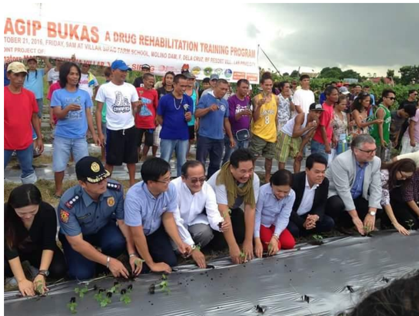
Ceremonial planting of seeds after the launching program with the Drug surrenderers looking on