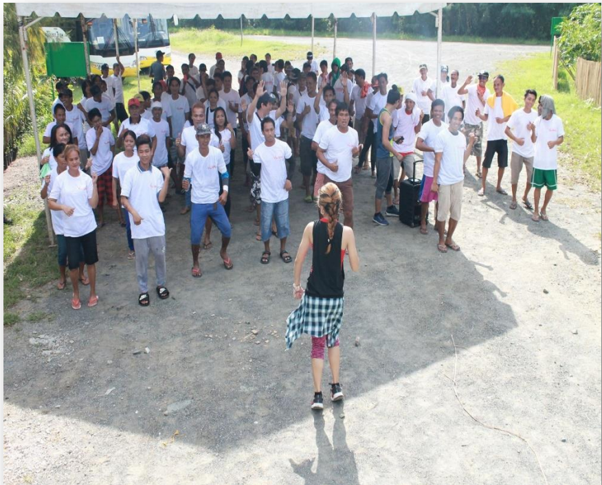
COASTAL CLEAN-UP, AS PART OF THEIR TRAINING IN CARING FOR THE ENVIRONMENT WHICH IS BEING HELD AT THE LAS PINAS –PARANAQUE CRITICAL HABITAT AREA