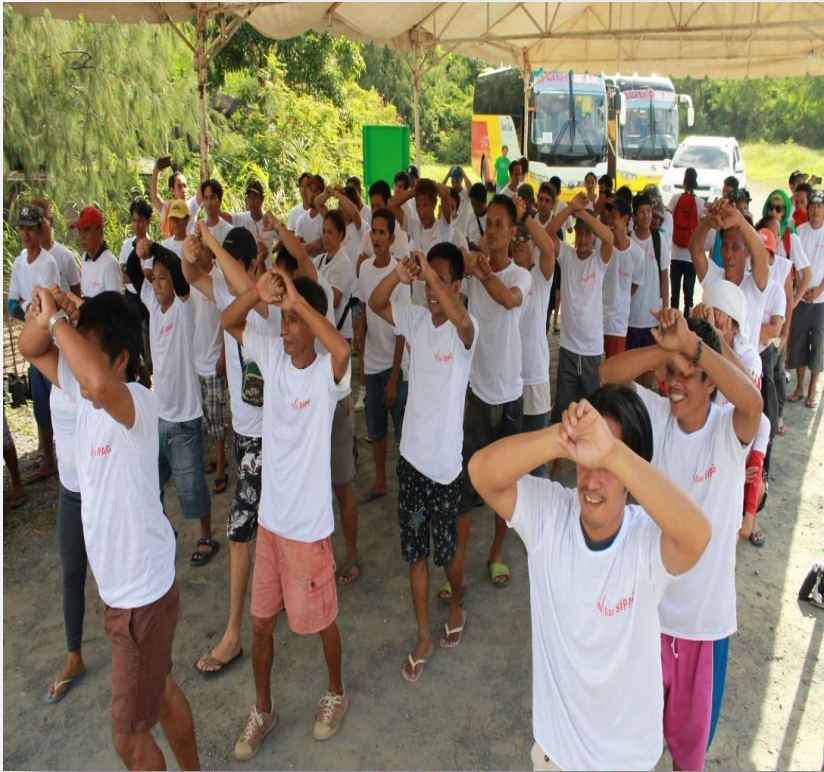
ZUMBA LESSONS BEING DONE AT THE VILLAR SIPAG FARM FOR DRUG SURRENDERERS, PART OF THEIR WELLNESS PROGRAM